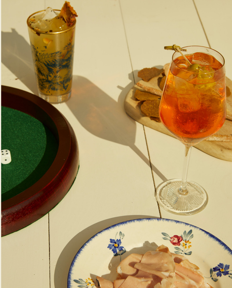
Take a drink at Le NESSAY, on the terrace...