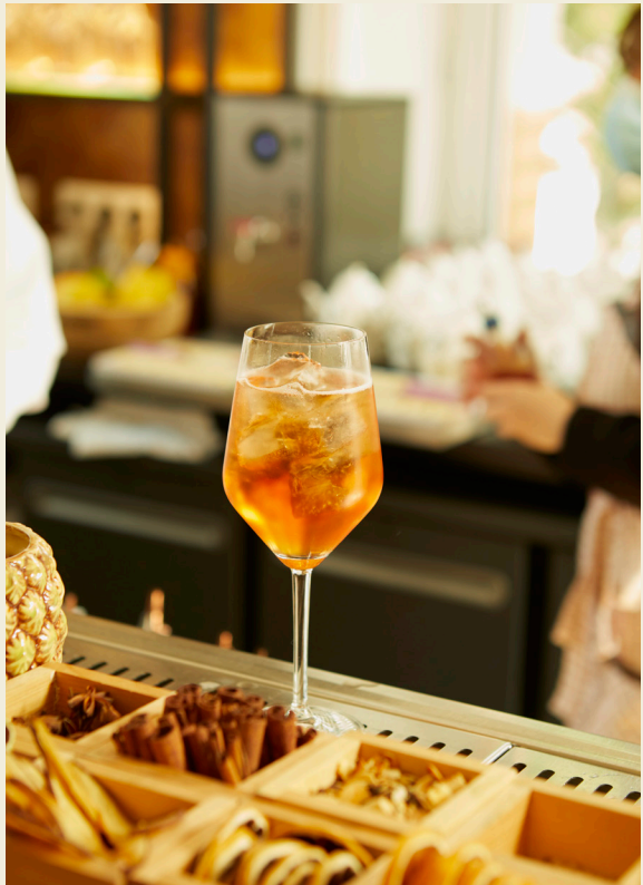
COOL OFF AND ENJOY